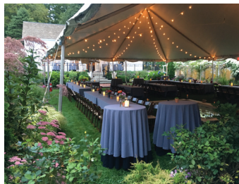
A beautifully adorned walled Garden and Garden House just moments before guests.