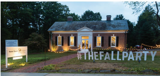
A view from Main Street of the brilliantly lit KTM&HC Visitor Center where hundreds of guests registered and had their photo taken.