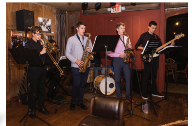
The Ridgefield High School Jazz Combo entertained guests at a fun-filled after-party in the Carriage Barn.*