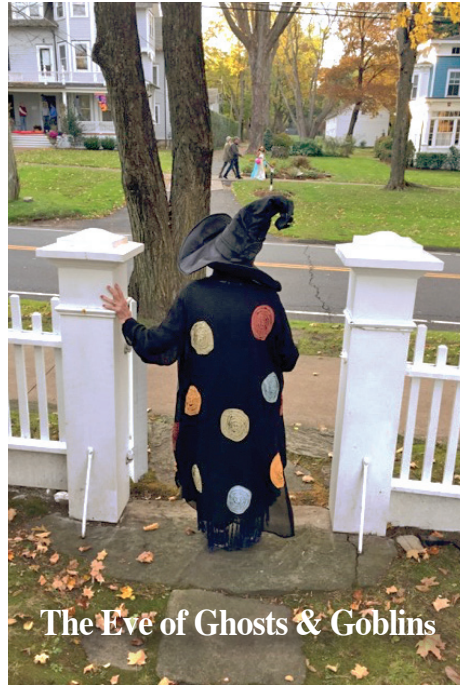
The Eve of Ghosts & Goblins